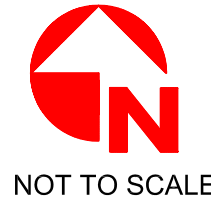
EXHIBIT T-8 TRAFFIC COUNTS JANUARY 2003